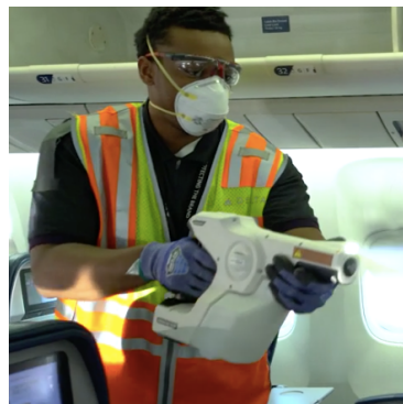
Above left: Examples of disinfectant wipes. Above right: Commercial fogger in use.