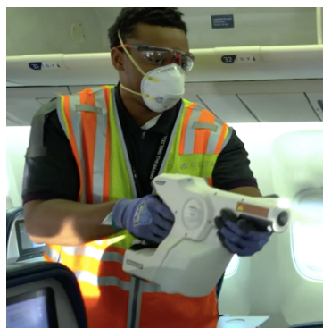
Above left: Examples of disinfectant wipes. Above right: Commercial fogger in use.